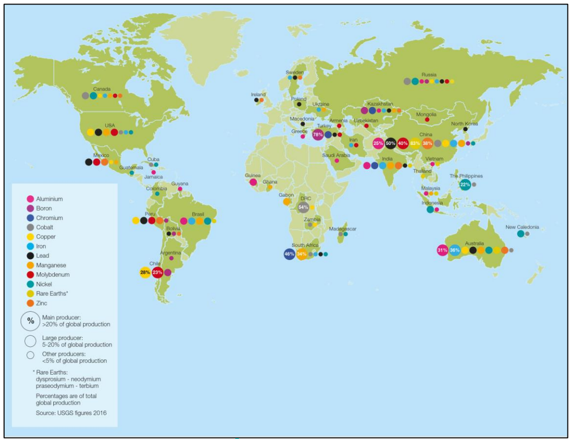
Figure 6.9: Producers of minerals and metals used in wind turbines